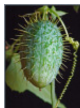
Wild cucumber drapes itself over its victim