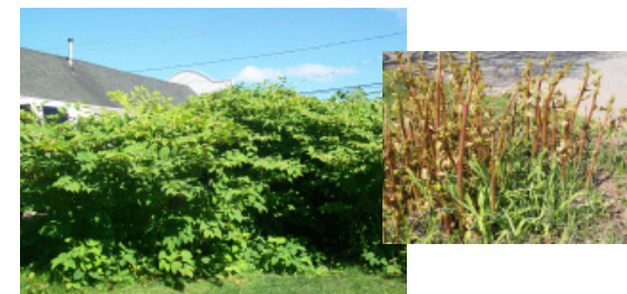
Japanese knotweed, a top-100 world invasive species, is rife in the Crapaud area