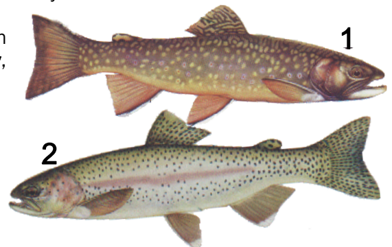
1. Brook Trout and 2. Rainbow Trout are in our streams. Which one is at a disadvantage locally ?

On page 2 of this issue, see some of the ongoing efforts DREAM and partners in the community have made over recent years to improve local fish habitat.