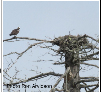
Osprey on Green Road

Last year we were able to see a Eastern Kingbird, Osprey and Rose-breasted Grosbeak to name a few. Each year we are able to locate new species!