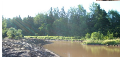
Similar views of the new pond, being dredged, flooded, and (almost) finished